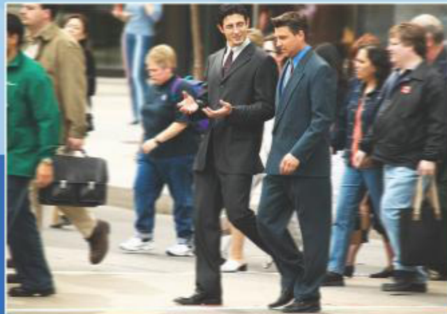
Employee Tracking System

A Quick Reference to Employee Timesheet at your Desk